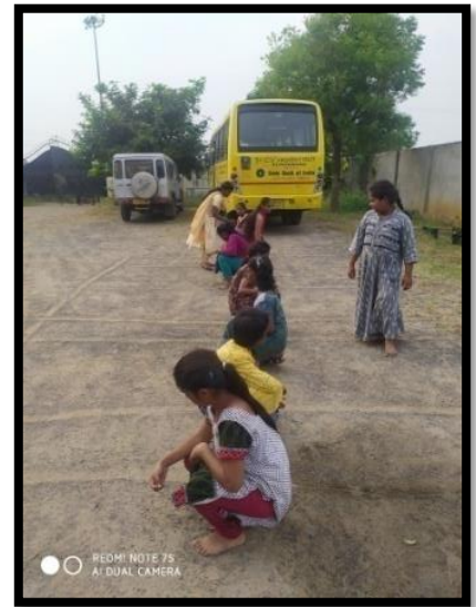
15-11-2022: Coordinator conducted awareness class to the Children on "Greed is the hand of Sorrow".