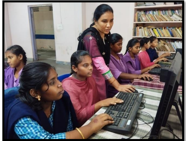
09-02-2025 : Children enjoyed in playing games.