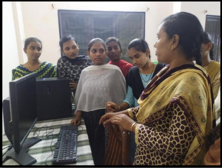
15-06-2023: Children participated in the games.