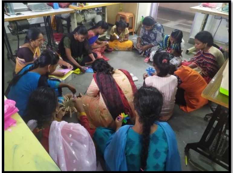
07-06-2023: Coordinator conducted awareness class to the Children on “Personal Hygiene”.