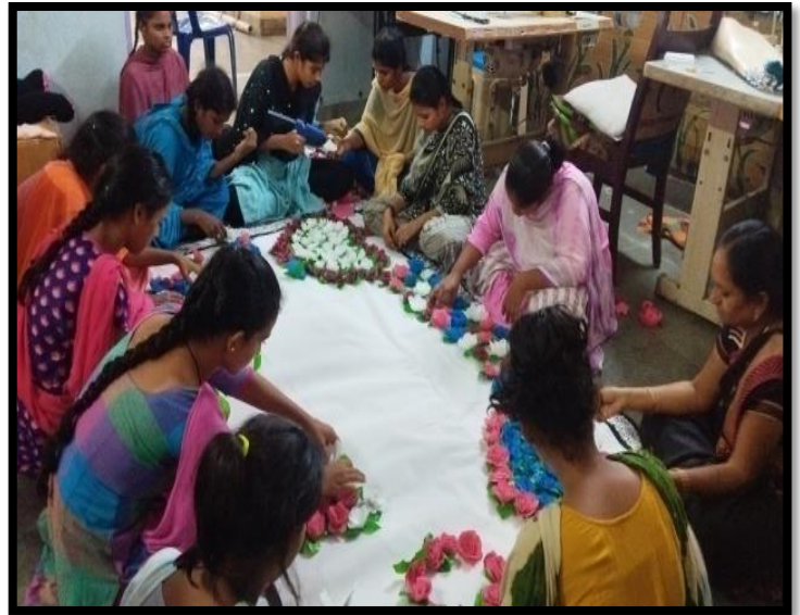
21-05-2025 : Children participated in the games.