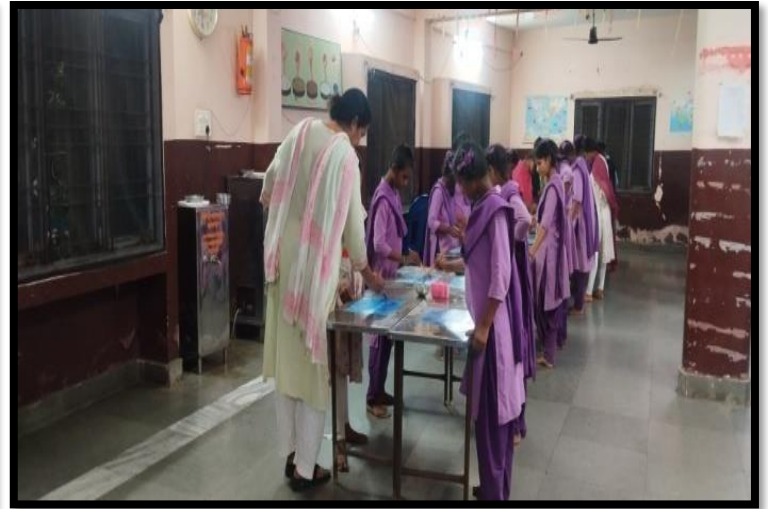
09-11-2024: Children participated in the craft class.